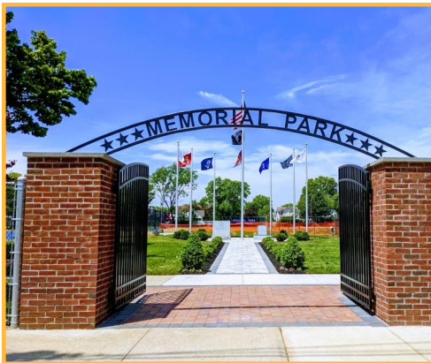
Newly build Memorial Park Entrance

Newly built Memorial and the six flag poles representing the branches of the US Military