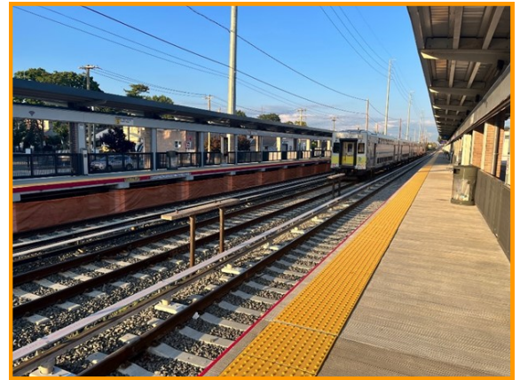
New platforms at the New Hyde Park Train Station