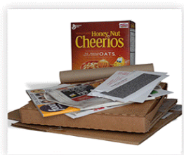
Newspapers, Mail, Cereal Boxes, Magazines and Flattened Cardboard