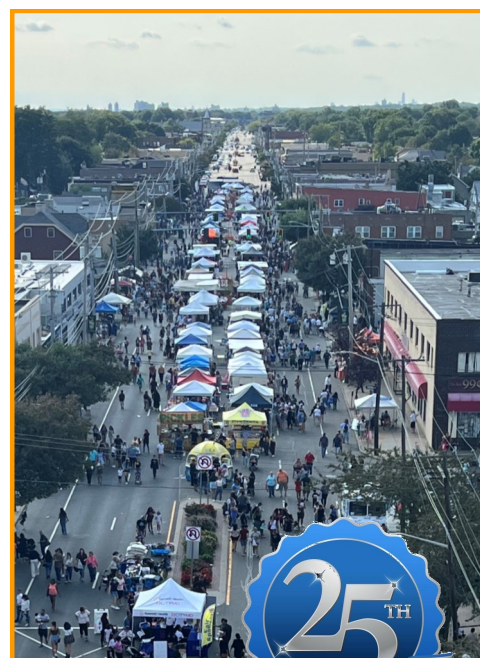
Arial Photo of the Village Street Fair

year's event to the people of our community.