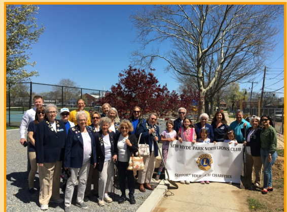
New Hyde Park Lady Lions Club, the Village Tree Committee and Village Trustees at Memorial Park

We hope you take advantage of the Tree Planting initiative by calling the Department of Public Works at 516 354-0064.