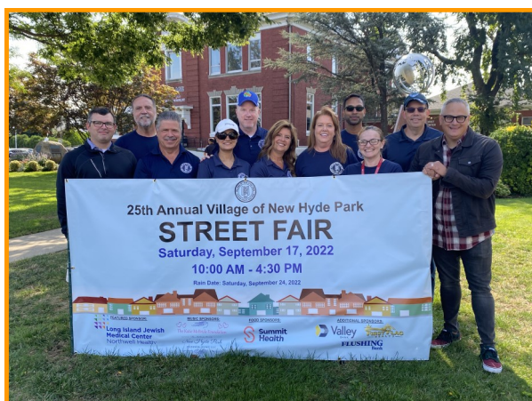
Village Trustees and Village staff at this years Street Fair