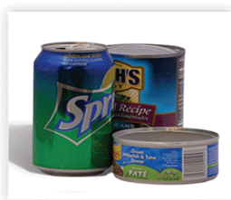
Aluminum and Steel Cans (no lids, empty & rinse)