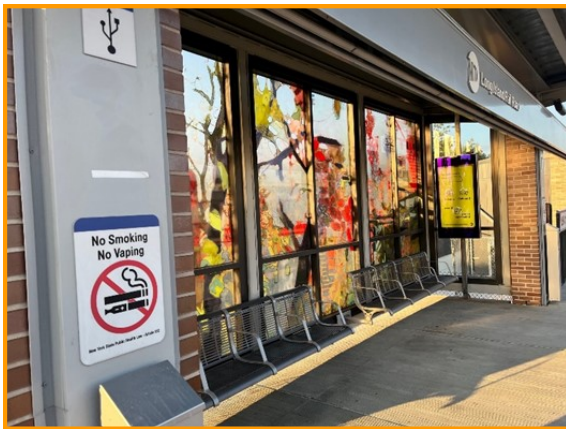
The construction of the new Platform Waiting Area

As noted in the Summer Newsletter, the South 12 th Street Pedestrian underpass opened February 28, 2022 which was followed-up by the opening of the newly renovated NHP Station House on May 2, 2022. At the request of the Village, the pedestrian underpass was opened prior to construction being completed. Since February, a number of the remaining items at the pedestrian underpass have been completed. These items include the installation of a permanent railing, security mirrors at the bottom of the stairs/access ramp, security cameras, emergency call boxes, and replacement of grates to meet ADA requirements. Items that remain include the installation of security gates, and façade clean-up. With the activation of the 3 rd Track in August 2022, the temporary platform was removed on the South side and the new South side platform was opened. This also included the remaining platform on the South side which then allowed for all 12 train cars to platform.