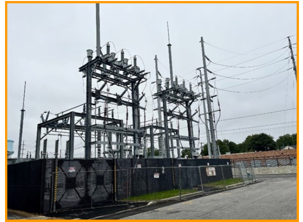
Ongoing Construction at the G-14 Substation

After much delay, the G-14 substation fencing was installed and the site was activated in August 2022. The delay in the activation was due to facility regulatory grounding requirements that needed to be met. As noted in the last two Newsletters, the Mayor, Trustee Burger, members of the Village Board, and local residents have voiced their concerns to the MTA and 3TC on the size of the substation and its ugliness. After much discussion, the MTA and 3TC have agreed to bump out the curb line by 5 feet on South 9 th Street to facilitate the planting of larger landscaping in an effort to mask the substation as much as possible. With the coordination of local residents we all have agreed to plant green giant arborvitae. These arborvitae are fast growing and can grow up to 50ft – 60ft. Trees are not favorable, as the branches can extend into the substation and become a hazard. The bump out of the curb, will involve the relocation of some drainage pipes and a fire hydrant. The MTA/3TC has agreed to make the relocation. The relocation of the curb will occur in the fall, and we hope to get the landscaping in before it is too late to plant. If it does become late in the season, the Village will request that it be completed in the Spring of 2023.