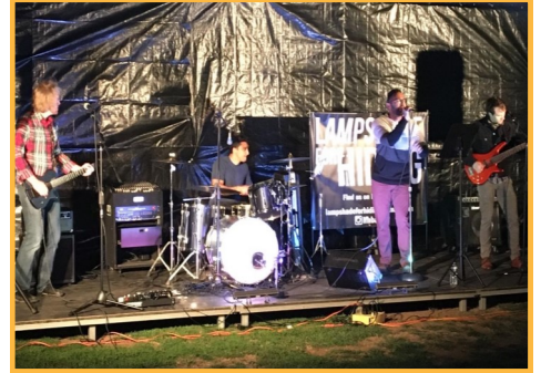
Lampshade for Hiding Concert