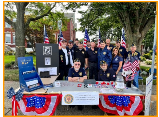
American Legion Post 1089 Members at this years Village Street Fair

https://www.americanlegionpost1089nhp.org or https://www.legion.org .