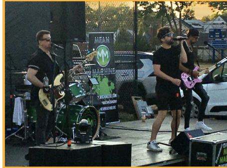
Mean Machine Concert