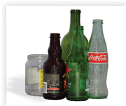
Bottles and Jars (no lids, empty & rinse)