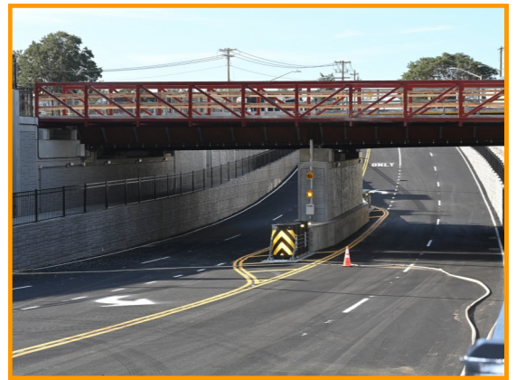
The New Hyde Park Road Underpass

The Board will be meeting with all parties at the end of October to discuss potential mitigating actions to the items noted above. We will keep our residents informed of what actions the MTA/3TC and Nassau County will be taking.