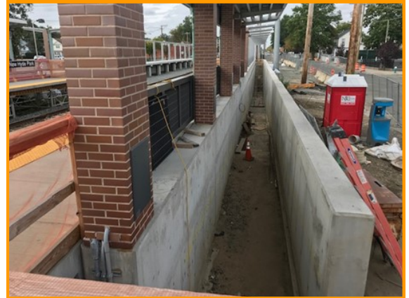
The construction of the new Pedestrian Underpass at the S 12th Street crossing.

The Village Board continues to push for the completion of the underpass as the closure of South 12th Street has been a huge inconvenience for all commuters due to continuous construction of the underpass. Discussions in mid September 2021 with the MTA and 3TC indicate that construction of the pedestrian underpass and platform will be completed at the end of December 2021, with an opening in the 1 st Quarter of 2022.