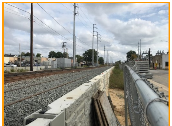
Wall Construction along 2nd and 3rd Avenue

The Wall Construction is moving forward. Wall construction began at Premier Boulevard, migrated to Covert Avenue, and then progressed on the south side towards South 12 th Street. The construction was completed in July 2021. The wall construction on the north side was scheduled to begin immediately along 2 nd Avenue, however 3TC experienced a delay in materials. Wall construction along 2 nd Avenue was restarted in mid-September and is scheduled to be completed in early November 2021. Once complete, the installation of fencing on the top of the wall will begin. The purpose of the wall is to help attenuate the sound of the train as it passes through New Hyde Park. It will also provide additional safety and security measures to prevent un-authorized entry onto the tracks.