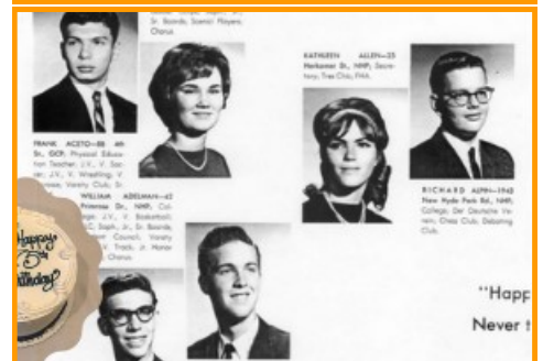
NHP Memorial Class of 1964