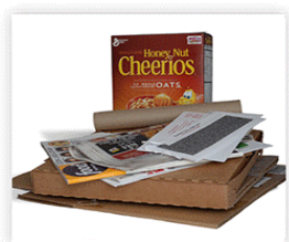
Newspapers, Mail, Cereal Boxes, Magazines and Flattened Cardboard