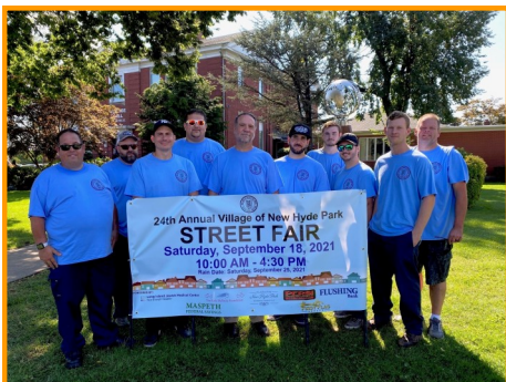
Village DPW (left) and Village Hall staff (right) working the Street Fair