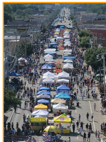
Aerial Photo of the Village Street Fair

A special thanks to all those involved in planning the event as well as all the Village residents and merchants for their support and hospitality throughout the day.