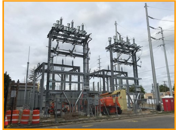
Ongoing Construction at the G-14 Substation

A business owner on 3 rd Avenue, adjacent to the substation has issued a noise complaint with respect to the substation utility fans. At this time we are evaluating whether these utility fans exceed the daytime 70 dB level or the nighttime 60 dB level for an industrial zone. The testing and commissioning of the substation is scheduled to begin in mid fall and currently scheduled to be operational by the end of 2021.