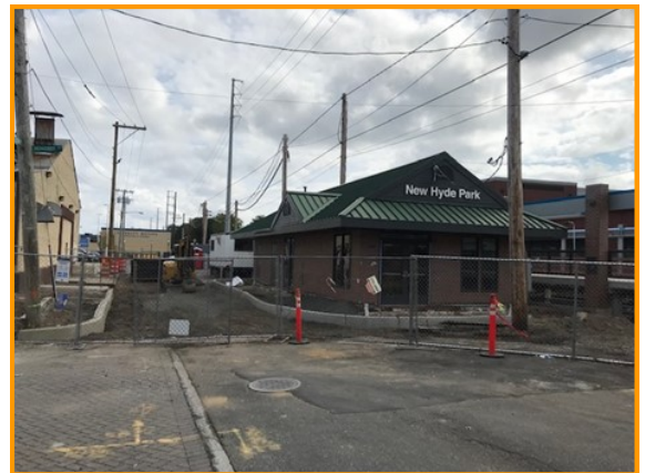
Construction at the New Hyde Park Station House

The MTA and 3TC have agreed to modify the truck access on the intersection of 3 rd Avenue and the Covert Avenue extension. This will permit access of trucks that are 55 feet in length. The current constructed intersection prohibits these size trucks from access. Our local businesses and Village were compromised because of the poor design. Along with this approval, the Village did have to agree to a parking plan that makes 3 rd Avenue one way – east bound to South 12 th Street. This was required in order to allow trucks to safely make the turn from the Covert Avenue extension onto 3 rd Avenue, without going into opposing traffic. As noted in the spring newsletter, this does translate to a loss of approximately 50 parking spaces which translate into lost parking revenue for the future. The Village Board is not happy about this and will look at other parking alternatives to make up for the lost. The re-construction of the area should occur later this fall. It is dependent on the weather and the timing of the asphalt plants shut down for the winter season.