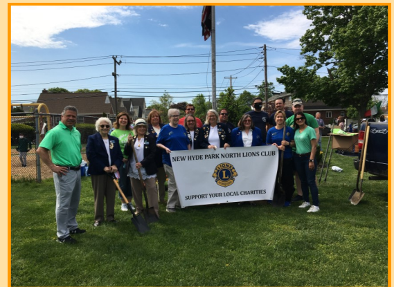
New Hyde Park Lady Lions Club , the New Hyde Park Village Tree Committee and Village Trustees at Memorial Park

We hope you take advantage of the Tree Planting initiative by calling the Department of Public Works at 516 354-0064.