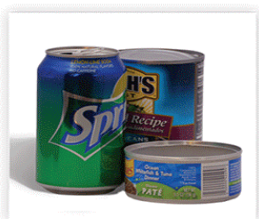
Aluminum and Steel Cans (no lids, empty & rinse)