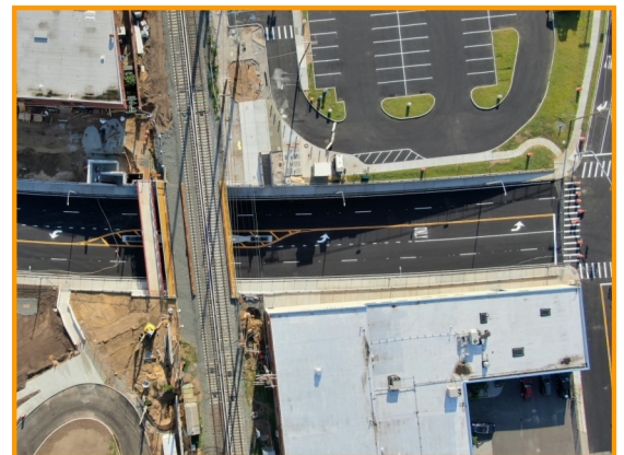
Areal of the New Hyde Park Road Underpass and Pedestrian Crosswalk