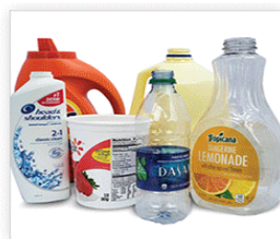
Kitchen, Laundry, Bath: Bottles and Containers (no lids, empty & rinse)