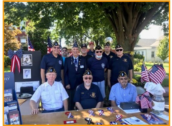
American Legion Post 1089 Members at this years Village Street Fair