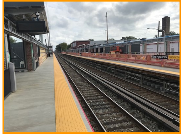
New platforms at the New Hyde Park Train Station

It is great that the construction is moving forward, however it has left our Village, on 2 nd and 3 rd Avenues between Covert Avenue and New Hyde Park Road, as well as a few blocks west, a complete mess. We are working everyday to minimize the impacts, including getting the word out to our residents regarding night work and road closures. We have had several instances over the past few months of unexpected road closures and instances where the Village did not receive adequate upfront communication or any communication, of changes to planned construction. This has frustrated our Village Board. Trustee Rainer Burger and Mayor Chris Devane took action and have re-instituted bi-weekly construction meetings with the MTA and 3TC. The Village Board is committed to ensuring our residents get the most up to date information on all projects and inform residents of any major construction impacts.