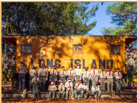
Troop 298 at its annual Thanksgiving Outing

For more information on eligibility please visit our website at www.vnhp.org .