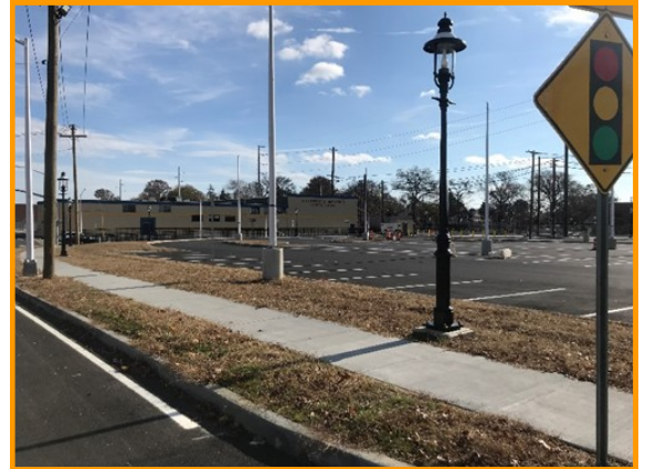
New Commuter Parking Lot on the corner of New Hyde Park Road and Plaza Avenue

The New Hyde Park Road underpass was opened to traffic on August 24, 2020. Construction has continued around the area as well as some clean-up. The Pedestrian passageway across New Hyde Park Road was opened in October, and decorative lighting was installed on New Hyde Park Road and around the new Commuter Parking Lot, as well as striping in the new lot. As mentioned at our Board Meetings, the Village Board is working with 3TC on a number of safety concerns regarding New Hyde Park Road. The misalignment of the south bound lanes required some re-striping. Another item of concern has been the visibility of pedestrians in the crosswalks on the north side of the underpass. We are pressing 3TC and the MTA on a resolution to address this visibility issue. In addition, the Village Board has raised a number of concerns with the entrance into the new Commuter Parking Lot. Specifically, with the left turning lane from Plaza Avenue into the lot. The Village met and surveyed the area with 3TC/Stantec in October 2020. 3TC/Stantec agreed with the Village Board's concerns and are currently developing some striping and signage modification to the area.