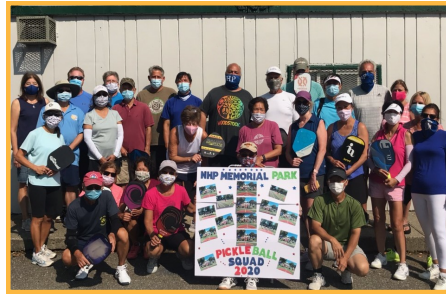
Participants of the New Hyde Park Pickleball Tournament