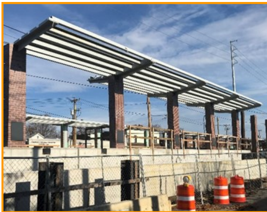
New Platform at New Hyde Park Road Train Station

Work is progressing well at both the station house and the platform area. The platforms are pretty much in place on the east side with the brick façade being installed. New ADA ramps and stairs are under construction as well. Residents can see the construction of two mechanical support buildings on both the north and south side of the platform. These buildings are for the overall maintenance of the new platforms and station house. The station house itself is undergoing renovations. This includes a new blue grey color on the roof (versus the current green), per the Village Board's request. The new color will match the station platform roof as well as the Merillon Avenue station roof, which will bring consistency along the corridor. The work will continue into next year.