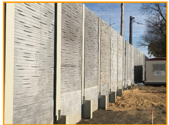
Wall Construction heading toward Garden City

The foundation work continues along the corridor for the wall from 6 th Avenue, heading east to Covert Avenue and New Hyde Road. Residents will see wall panel installations in the area as well as just east of New Hyde Park Road. The Village was informed that many of the panels are still being manufactured and a majority will be delivered in the January/February 2021 time frame. As noted, in the previous Newsletters, this is a retaining and sound attenuation wall along the right-of-way. It has been noted that the Village will at times experience anywhere from 10 – 12 trucks per day. We have not seen that level of activity, with respect to wall construction. We will notify our residents if the Village hears any increase production and installation of the wall panels.