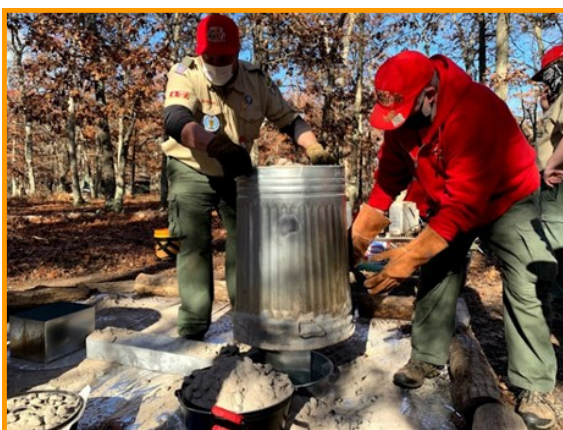
Scouts working together to build a fire