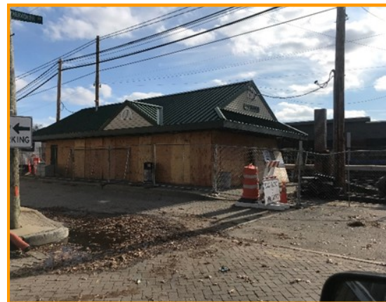
Ongoing Renovations to the New Hyde Park Train Station House