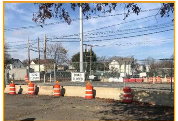
Permanent closure of South 12 th Street

With the closure of South 12 th Street, a new vehicular traffic map and pedestrian detour map has been published. For details please visit the Village Web Site or lirrexpansion.com .