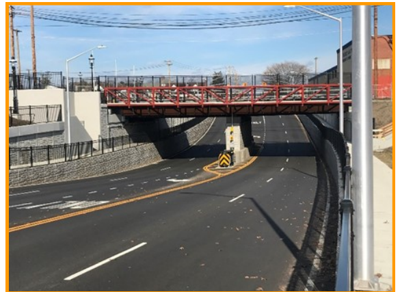
New Underpass at New Hyde Park Road