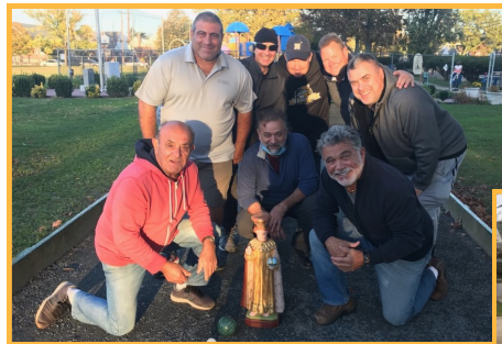
The New Hyde Park Bocce Ball Team (above and right)

With Bocce Ball being on the rise with popularity, the Village of New Hyde Park residents have banded together and have created a Bocce Ball team. If you want to join, no experience is needed only a desire to meet new people and play a fun and competitive game. The Bocce Ball team meets every Monday, Wednesday, and Thursday from 5:00 pm to 6:30 pm and Sunday from 10:00 am to 1:00 pm.