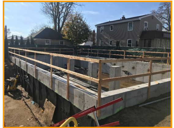
Construction at the G-14 Electrical Substation

The substation fencing was also removed and directly exposed the construction site to the adjacent property causing a safety hazard. Although some of the issues were rectified, there are still a number of items that remain open and the Village Board is quite frustrated with the lack of urgency and response by the 3TC Leadership and the lack of engagement by the MTA. One of the items which were noted in the last newsletter is the replacement of the utility style fencing with an aesthetically pleasing wall. We have been assured that the engineers are working on the new design but have yet to see any drawing or designs. The Village Board will continue to pursue this matter. The MTA noted that they are looking to have the construction complete and the substation fully operational in the 4 th Quarter of 2021.