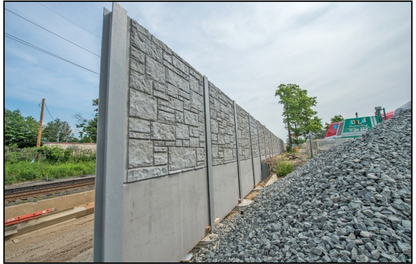
Wall Construction Continues from 6 th Avenue East to Covert Avenue

The LIRR wall construction on the South side from 6 th Avenue heading east to Covert Avenue continues. This is a retaining and sound attenuation wall along the right-of-way. The Village will at times experience anywhere from 10 to 12 trucks per day. Based on the Memorandum of Agreement with 3TC trucks should be staged off site and called in when needed. The Village Board is watching over this activity and ask Residents to contact the Village Hall if they see otherwise.