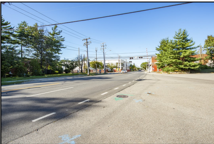
New Hyde Park Road before Grade Crossing elimination

By the time the Winter Newsletter is published, New Hyde Park Road will be completely closed and under construction. New Hyde Park Road will be closed from Plaza Avenue to 4 th Avenue for approximately 7 months with a scheduled re-opening over the 2020 Labor Day Weekend.