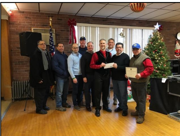
Village Officials, local elected officials, and the Magic of Amore thank Chamber of Commerce and New Hyde Park Lions Club members for their generous sponsorship of this family Village event.