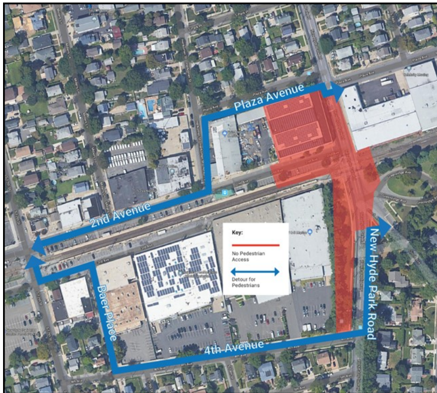
New Hyde Park Road closure - Pedestrian Detour Map

As we prepare for the full closure of New Hyde Park Road, the Village Board continues to press concerns to 3TC for the impact of increased traffic on residential streets and decreased parking in and around the construction area. The Village has insisted on an extensive outreach when relaying traffic mitigation plans and extending it to a much broader area, including north and south of New Hyde Park. This will include employers, residents, community groups, Fire Departments, Hospitals, School Districts, and more, with the intent to divert ‘transient’ traffic away from New Hyde Park. The Village Board has insisted and 3TC/MTA has agreed to expand ‘Electronic Messaging’ on major roadways including the Long Island Expressway, Southern State Parkway, Hempstead Turnpike, Hillside Avenue as well as Jericho Turnpike and Stewart Avenue. There will be updates posted on Social Media, notifications on 1010 WINS, Newsday, News 12 and more, as well as train station announcements, website postings, and e-blasts. Locally, we are working with 3TC and the MTA on detour plans, and similar to the Covert Avenue closing, there will be adjustments made as needed.