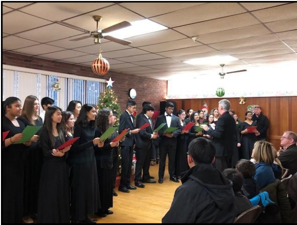
The New Hyde Park Memorial High School Band and Chamber Singers perform at the Tree Lighting.