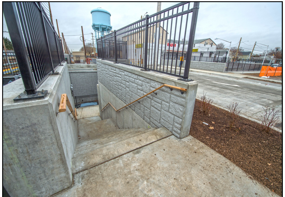
Covert Avenue walkway now open to pedestrian traffic

The primary work at Covert Avenue underpass is completed but finishing work continues. Since the Fall Newsletter, we have seen the completion and opening of 2 nd Avenue and 3 rd Avenue stairwells, road striping and signage erected, as well as some landscaping work. The Village Board requested that 3TC stop any additional landscaping until the upcoming planting season. In addition, the Village lost approximately 30 trees last year as a result of the construction. These trees will be replaced based on the girth of the removed trees.