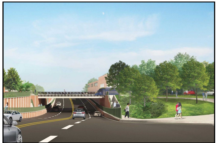
New Hyde Park Road after Grade Crossing elimination