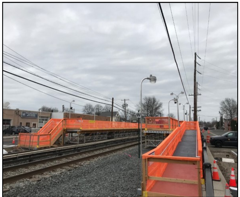
New Hyde Park Station Temporary Platform

Along with the closure of New Hyde Park Road, LIRR commuters will be able to access the railroad via a temporary platform that has been constructed between Covert Avenue and South 12 th Street along 2 nd Avenue and 3 rd Avenue. This will be a temporary 10 car platform. These platforms are ADA compliant, include weather shelters, lighting, public address system, and a number of access points along 2 nd and 3 rd Avenues. Beside the existing Commuter Lot on South 12 th Street and 3 rd Avenue, additional parking will become available at 124 Covert Avenue, a small parking lot on South 12 th Street and 2 nd Avenue. The Village Board is in negotiation with 3TC and Holy Spirit Church for use of the Parking Lot located on Covert Avenue and 1st Avenue. This combined will provide more than 100 temporary commuter and residential parking spots and will be conveniently located near the temporary station platform.