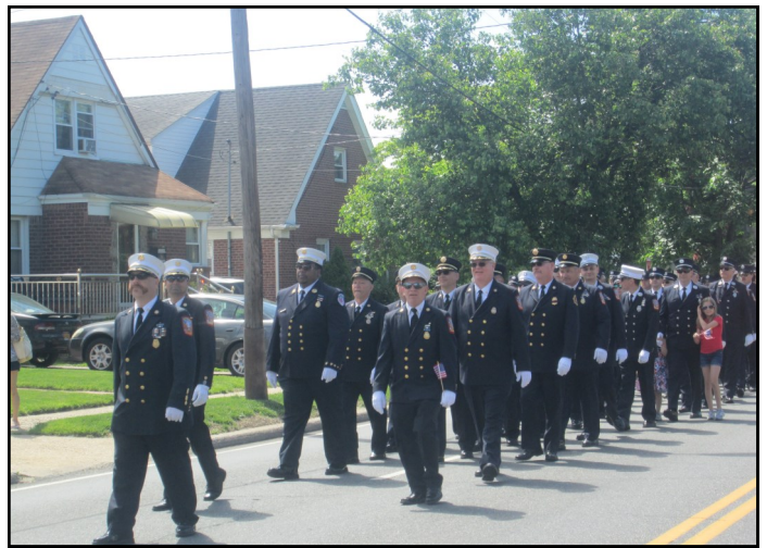
Officers and members of the New Hyde Park Fire Department.