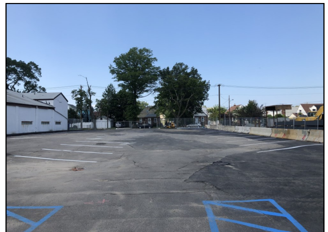
A new commuter parking lot was constructed in the previous location of the storage facility at 115 New Hyde Park Road. This lot replaces, one for one, the parking spaces lost from the closure of 2nd Avenue.

POP Officers from the 3rd Precinct have offered to conduct a SCAM Prevention Seminar at Marcus Christ Community Center in late September or early October. At the time of this publication, the date and time has not been finalized. So, please check the Village website and/or the e-Board for further details. This seminar runs approximately 1 hour, which includes time for audience questions or discussion.