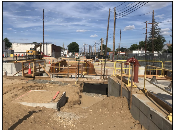
One of the three sections needed to construct the new bridge at Covert Avenue has been installed.