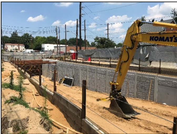
Excavation on Covert Avenue continues. New retaining walls and drainage are being installed.

Covert Ave Construction: Overall, the Covert Avenue construction remains on track with the scheduled re-opening in October 2019. The tracks are being raised, the pits on both the North and South side have been dug, undergrade drainage is being installed, retaining walls are in place, and the new bridge supports and infrastructure are progressing well. Looking at the pictures below, you can already see the exterior façade wall being installed. By the time you receive this Newsletter, the "push" of the new bridge, scheduled to take place Friday, August 23 through early Monday morning August 26, will be complete. This is a significant milestone in the completion of the Covert Avenue Undergrade Crossing Project.