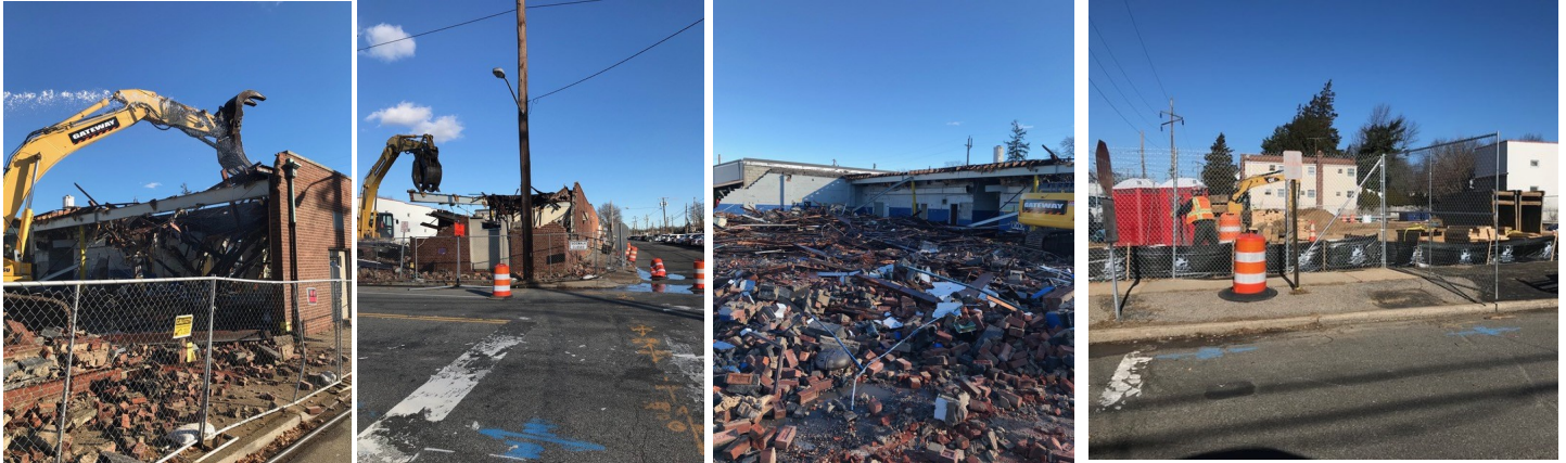
The demolition of the building at 124 Covert Avenue occurred in December 2018. The building on 115 New Hyde Park Road will be demolished next, although no date has been set.

As noted in the previous newsletter and at Board Meetings, to mitigate safety concerns and maintain Fire Department response times, with the closure of Covert Ave, a temporary Fire Department facility will be constructed in the Municipal Lot on South 12 th Street. This temporary facility will house equipment and fire department vehicles. The Village Board and the New Hyde Park Fire Department received the Design Plans in December 2018 and they are currently under review.