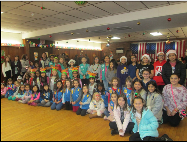
Children enjoyed indoor fun and activities while patiently waiting for Santa and the lighting of the Christmas Tree.