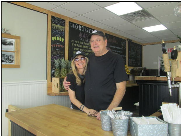
Serving fresh and delicious Acai bowls, granola, and juices, Sobol NHP at 1219 Jericho Turnpike is a great addition to the Village.