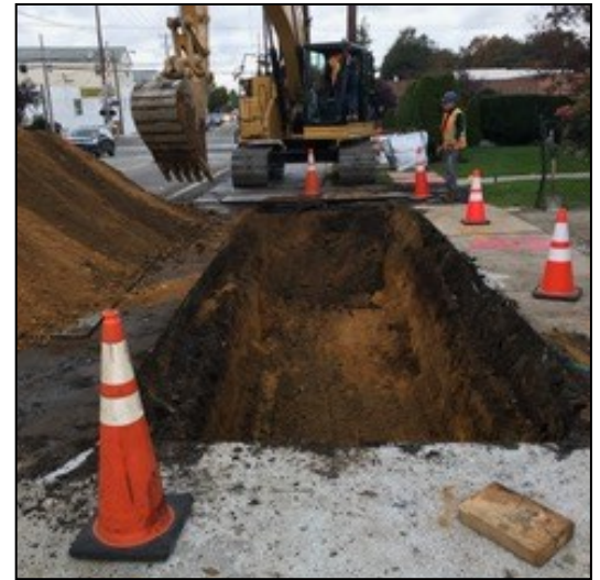
Excavation on Covert Avenue (looking north) for the installation of new sanitary drainage.