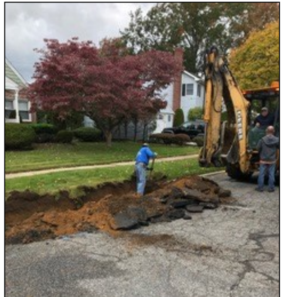
This section of curb along South 9th Street is being replaced to meet the new street grade.

If you have questions regarding this project or parking around the construction sites, please call DPW at 354-0064.