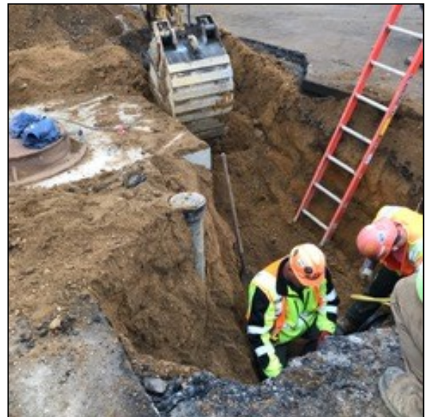
The water main line is being routed under the tracks from 2nd Avenue to Wayne Avenue.