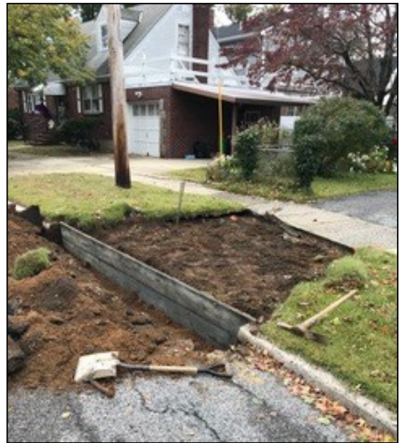
This driveway apron and curb cut is being replaced to align with the new street grade.