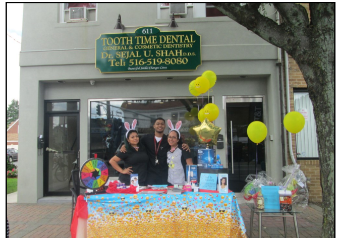
Tooth Time Dental provided important information on proper dental care along with free tooth brushes and tooth paste.