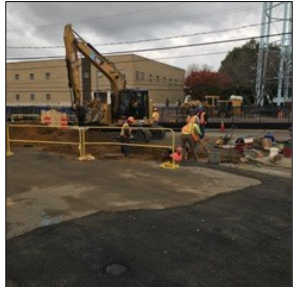
Utilities are being relocated in preparation of elevation changes on the north and south side of the tracks.

As noted in the last Newsletter, the Village has retained VERTEX Company to support the Village by performing reviews of engineering design and construction documents. Recent reviews included the Traffic Detour Plan, 90% Retaining Wall Installation, and Covert Ave 90% Under-Grade Crossing Plans. 3TC has responded with proposed updates to the Traffic Detour Plan which the Village Board is currently reviewing. The updates include local roadway mitigation options to include several restrictive turns to prevent commuters from utilizing residential streets as a cut-through. Other options being considered include creating Village residents-only streets, truck restrictions enforceable by the Police, and regional educational signage placed at Hempstead Turnpike, Nassau Blvd. and the Cross Island Parkway.