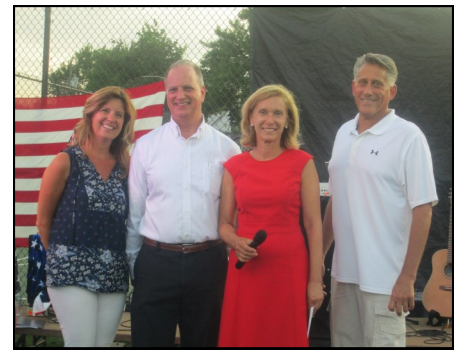
Senator Elaine Phillips joined Mayor Montreuil, Deputy Mayor Squicciarino and Tr. Pallisco to recognize and thank local veterans.