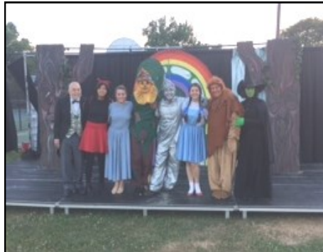
Members of Plaza Theatrical who performed in the Wizard of Oz take a bow.