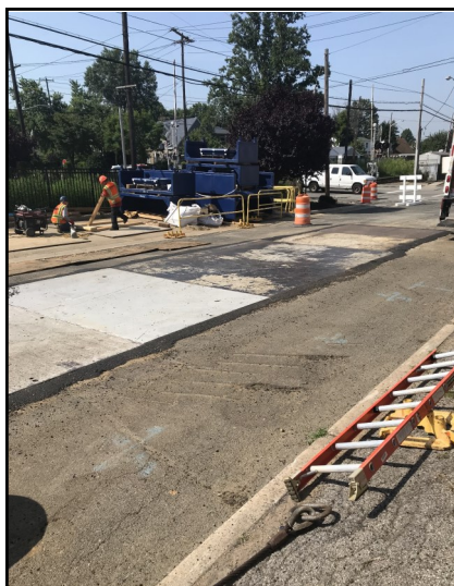
Contractors are required to keep construction sites clean of debris.

The Village has retained VERTEX Company, a renowned engineering firm, to support the Village by performing reviews of engineering design and construction documents. Some of the design documents reviewed include the Covert Avenue Under-Grade Crossing and Utility Relocation Design. One focus of the Village Board is to coordinate and work with the LIRR and subcontractors to keep the construction area clean and safe. Working with VERTEX, the Village has completed reviews on Construction Noise Control Plan; Community Air Monitoring Plan; Storm Water Pollution Plans; Safety, Health and Control Plan; Traffic Control Plan; and the Rodent Control Plan . The Village remains gravely concerned that some of the plans do not adequately address the potential for adverse impacts to New Hyde Park. In particular, the Noise Control Plan, Traffic Control Plan, and Rodent Control Plan. These plans do not provide the details necessary, as well as the means and the methods for mitigation. As an example, the Noise Control Plan provides no detail on how 3TC and LIRR plans to mitigate (muffle) the noise as they proceed to drill - 24 hours a day - under the tracks at Covert Avenue.