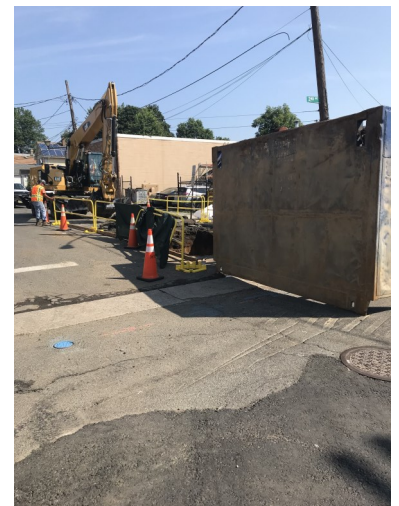
New fiber for utilities were placed under the railroad tracks at South 8th Street from 2nd to 3rd Avenue.

For more information on the LIRR 3 rd Track Project, please visit the Village web site: http://www.vnhp.org/lirr