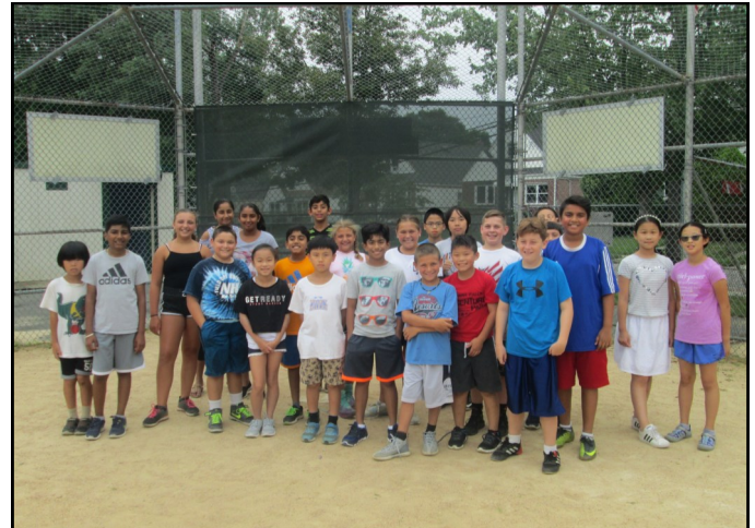
Organized games and activities kept the children in the afternoon session busy and engaged.