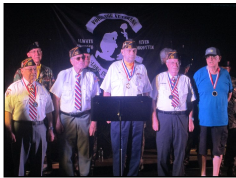
Some of our local veterans who received special recognition at the Voices for Veterans concert.