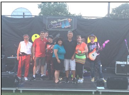
Guilty Pleasures rocked Memorial Park with classic 80's music.