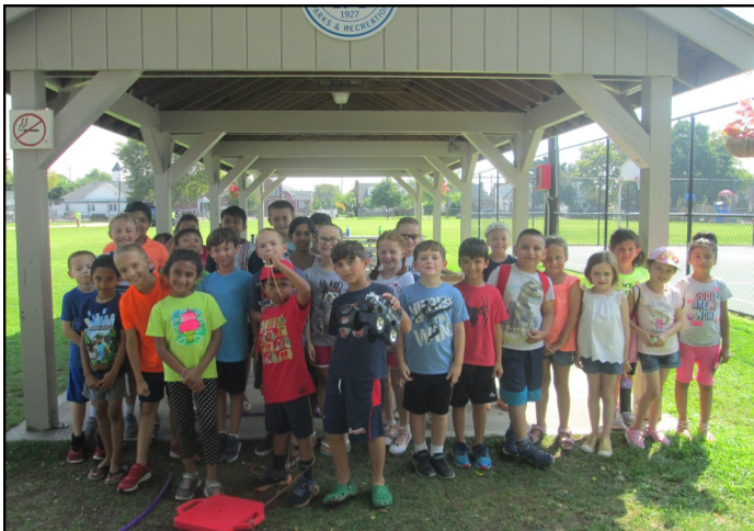
Children in the morning session were eager to begin fun activities every day.