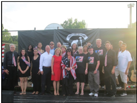
Dr. G's Voices for Veterans presented a musical tribute to honor veterans.