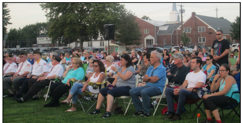
Great entertainment and great weather brought the crowds to Memorial Park this summer.