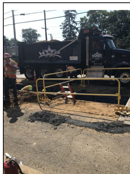
The installation of new sanitary drainage lines on 2nd Avenue.

As the new utilities are being relocated and installed, the Village Board is aggressively looking at the aesthetics, resilience, maintenance, and future development of the impacted 3 rd Track area. As such, the Village Board has expressed a strong preference for new or relocated utility lines to be placed underground. This will provide a more robust and resilient infrastructure in the future, while at the same time improve the aesthetics of our community as it eliminates the use of large utility poles. In addition, the Village Board is looking to redirect drainage storage under the proposed kiss and ride (currently 115 New Hyde Park Road) to enable future growth on that site.