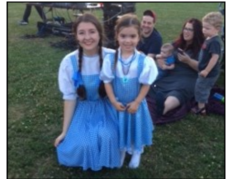
This young fan came dressed for the event and had the chance to meet the star of the show, Dorothy.