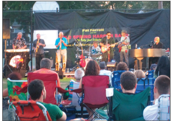
The Cold Spring Harbor Band had the crowd singing along to the songs of Billy Joel.