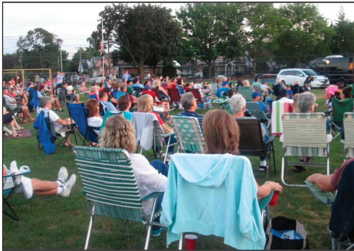
Warm summer nights and great family entertainment brought the crowds out for each show.

Finally, we want to acknowledge the contribution from the DPW crew. They maintain the Park grounds throughout the year and help set up and clean up after each event.