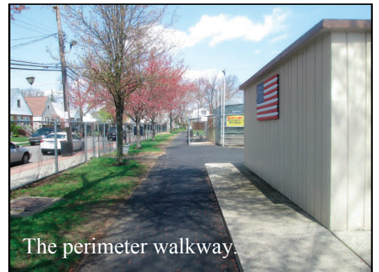
The perimeter walkway.