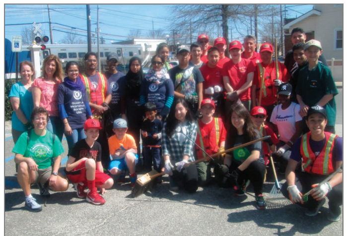
What a team. Over 30 volunteers came out to help beautify the Village. This was one of our largest groups ever!