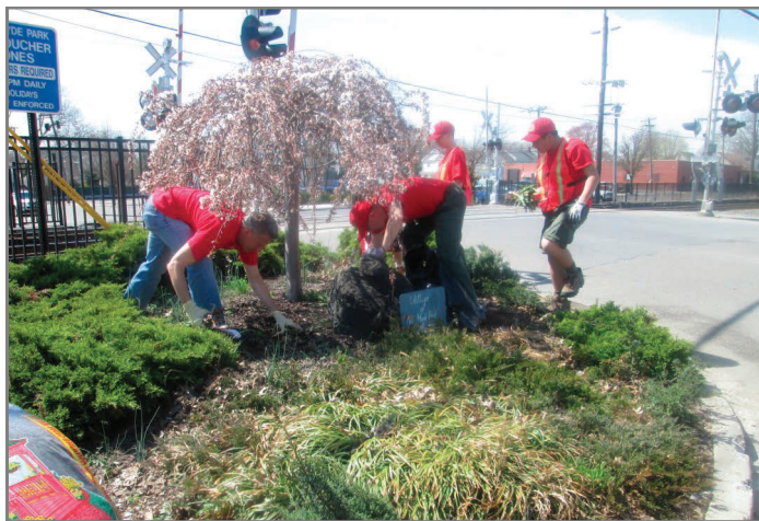
Volunteers removing weeds and debris from the planting area alongside the LIRR tracks at 2nd Avenue & S. 12th Street.