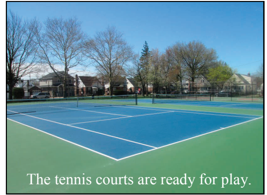
The tennis courts are ready for play.

We are pleased that the reconstruction has been completed just in time for everyone to enjoy summer events and activities in Memorial Park. We appreciate everyone's patience and cooperation during the reconstruction project.