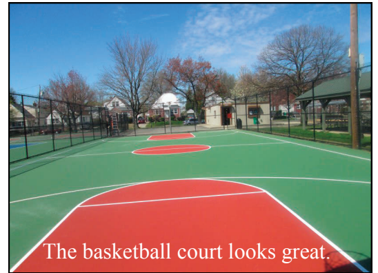
The basketball court looks great.