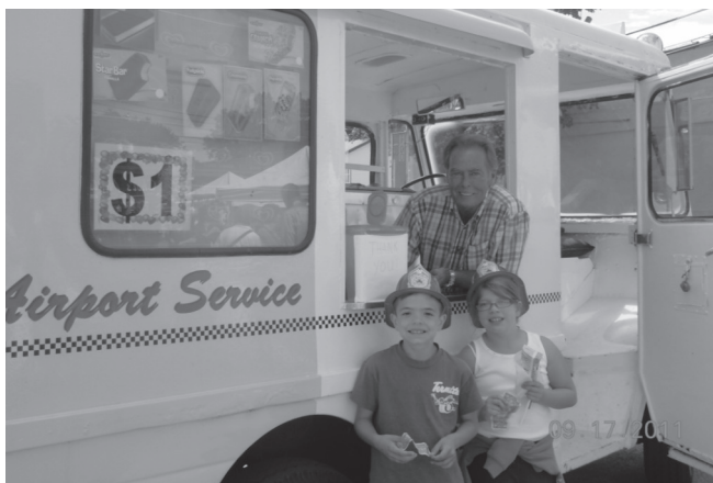
The Long Island Checker Cab of New Hyde Park brought their classic ice cream truck and donated all the proceeds of their ice cream sale to the New Hyde Park Youth Group.