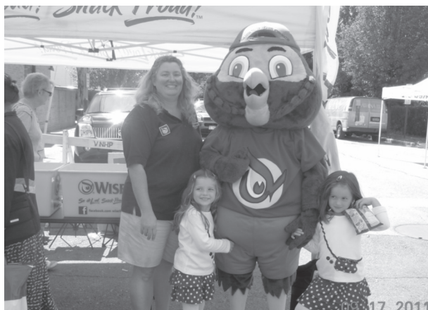
Peppy, the "Wise Owl" gave out free bags of chips and brought smiles to everyone he met. Thanks to Yorkshire Foods for their generosity, year after year.