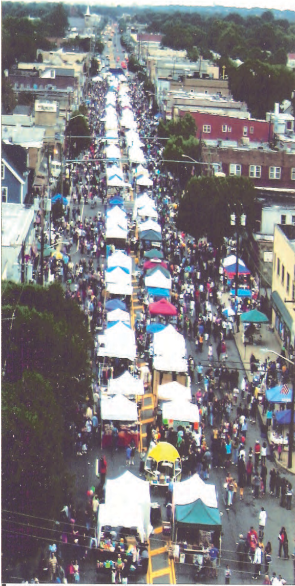
Thanks to Dan Bailey, DPW and the NHP Fire Department, we have a new aerial shot for next year's Street Fair marketing and promotional material.