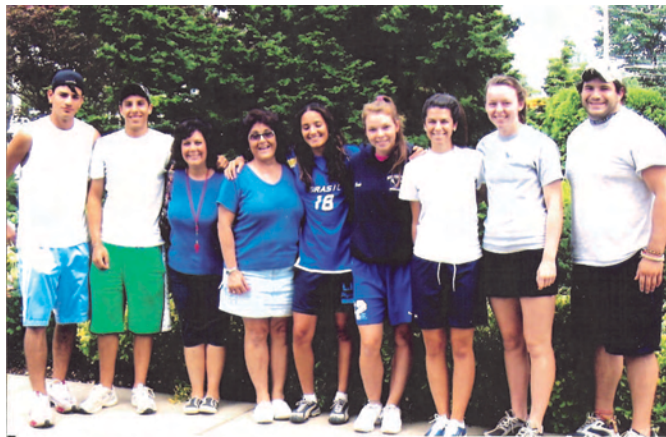
What a team - kudos to the counselors and program managers who make the program a success, year after year.