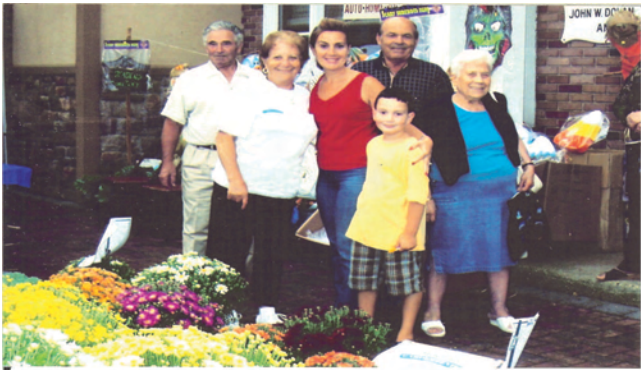
The generous folks at Milena's Garden Center always contribute to Village Beautification efforts.