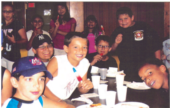
The end of season pizza & ice cream party is always a lot of fun. This is one happy group of children.