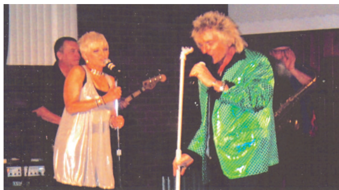
It was standing room only in Marcus Christ Hall for the talented Rod Stewart tribute band.